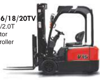
V series CPD13/15/16/18/20TV 1.3/1.5/1.6/1.8/2.0T Dual Drive Motor AC ZAPI Controller