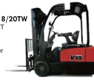
V series CPD13/15/16/18/20TW 1.3/1.5/1.6/1.8/2.0T Finger-Tip Dual Drive Motor AC ZAPI Controller